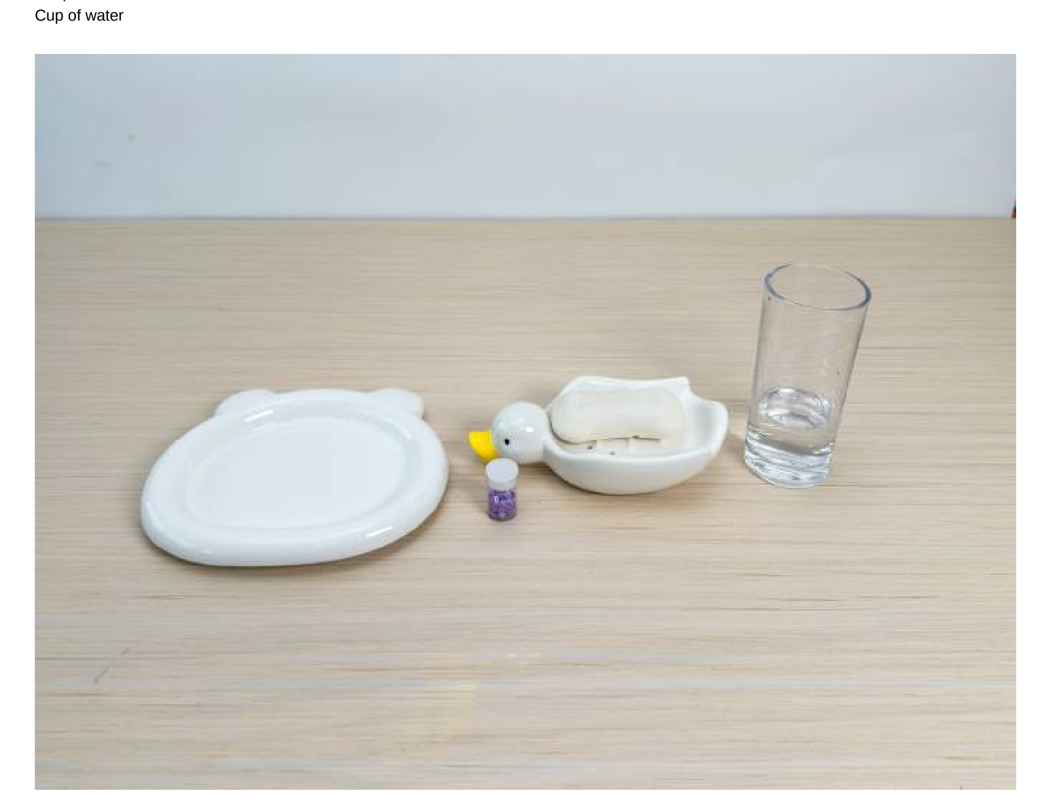
Plate Box of glitter Soap