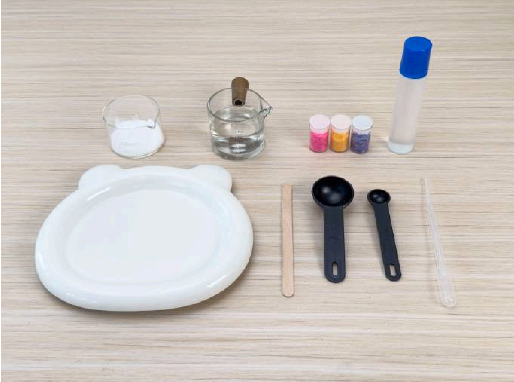
Plate Borax Water Mixing stick Measuring spoons Dropper Clear glue Glitter