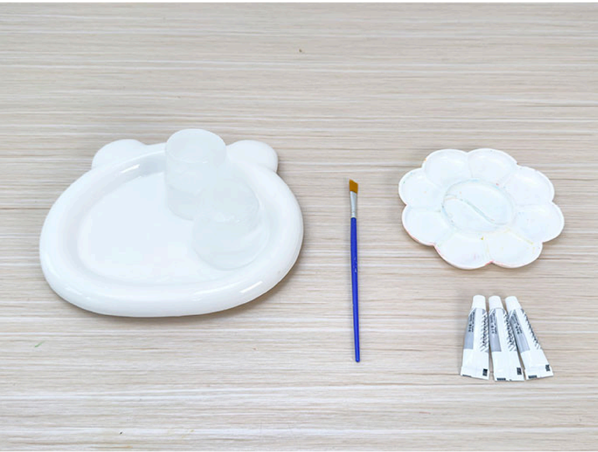
Plate Ice cubes Watercolour paints Paintbrush Paint palette