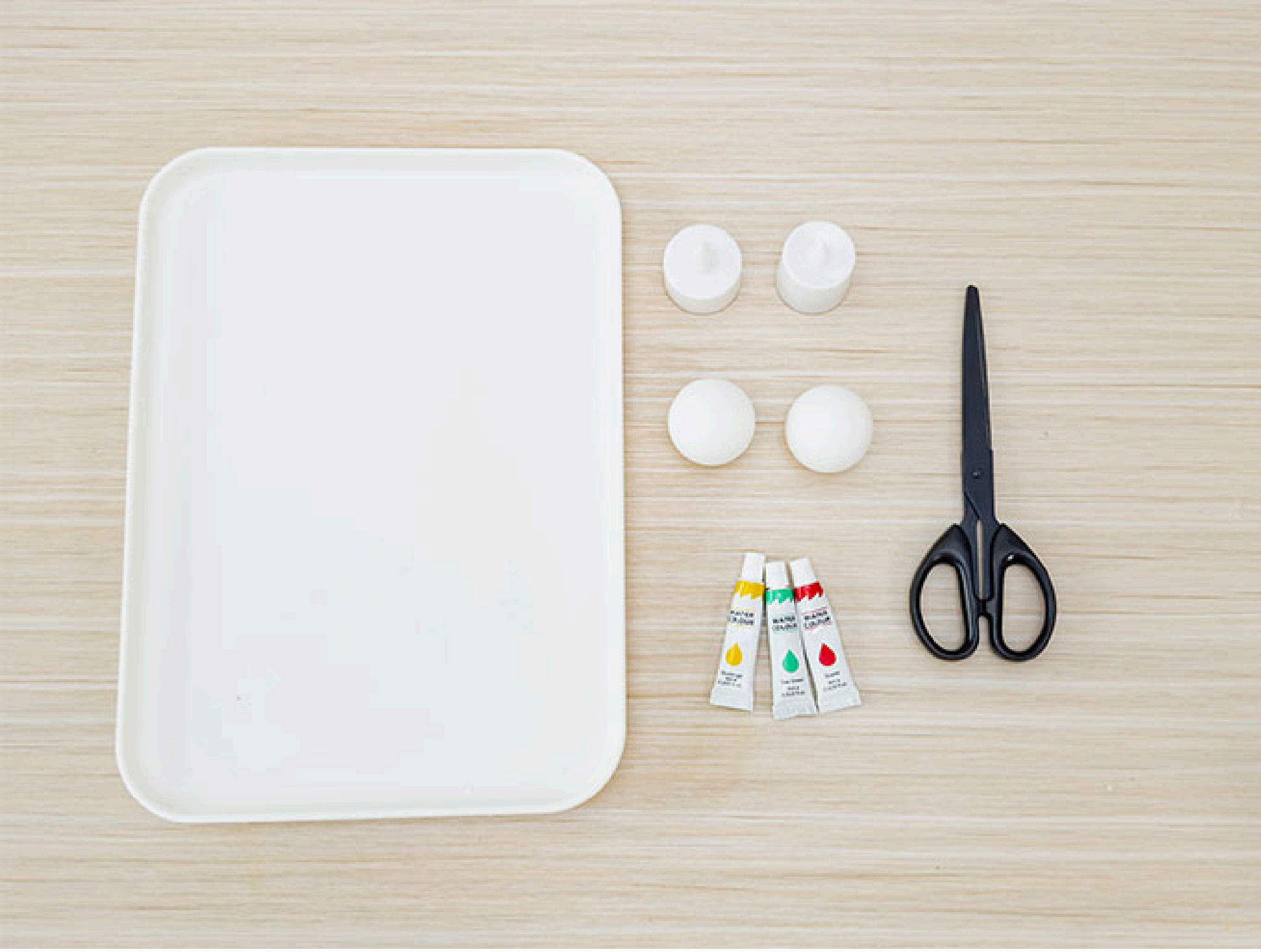
Plate Battery-operated tealight Table tennis ball Paint Scissors